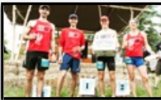
SIX03 RACE SERIES