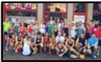
WEEKLY PUB RUNS